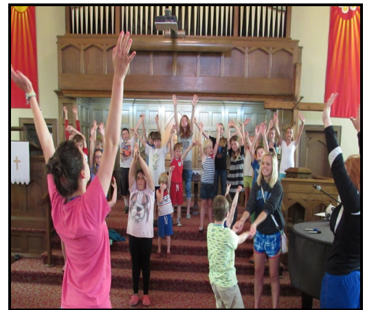
CAMP IN A VAN