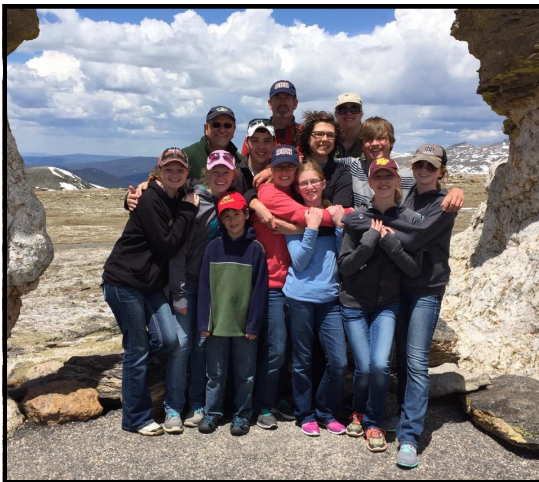
NEDERLAND, CO MISSION TRIP