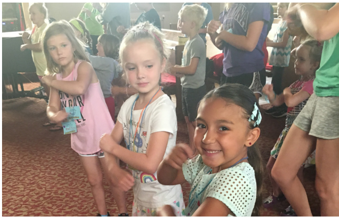
Singing at VBS