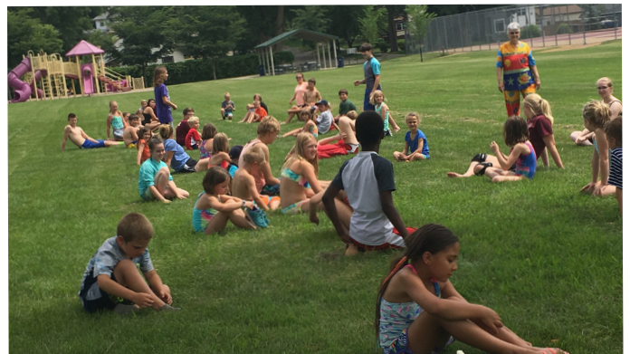
Water Day at VBS