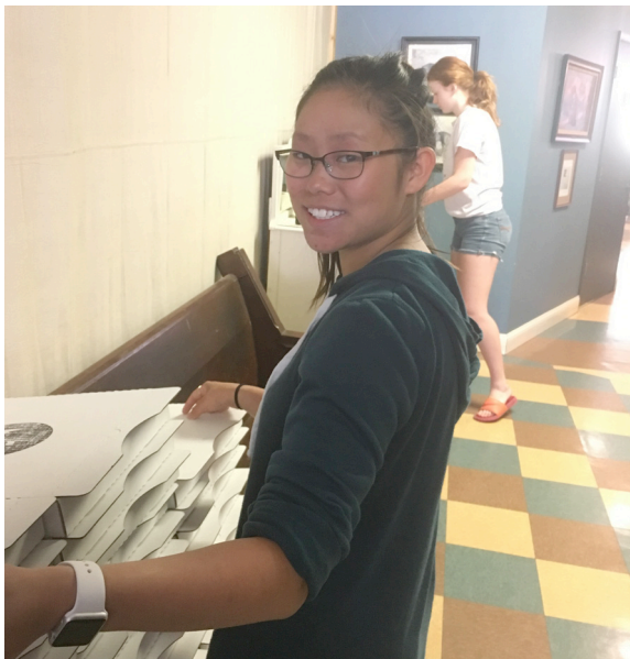
Guatemala Fundraiser at Union Pizza