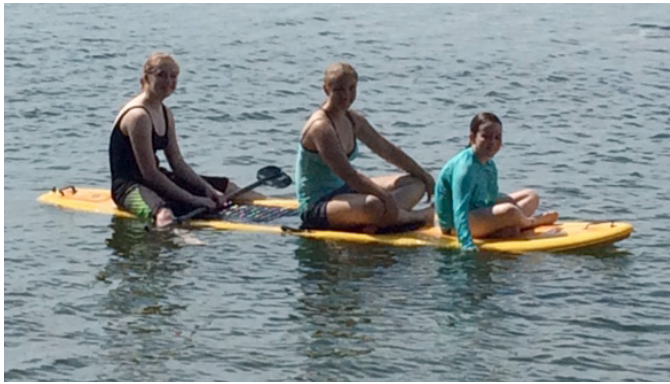
Lake Day at Loomer's