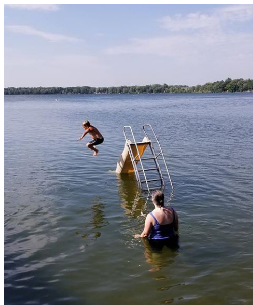
Lake Day at Loomer's