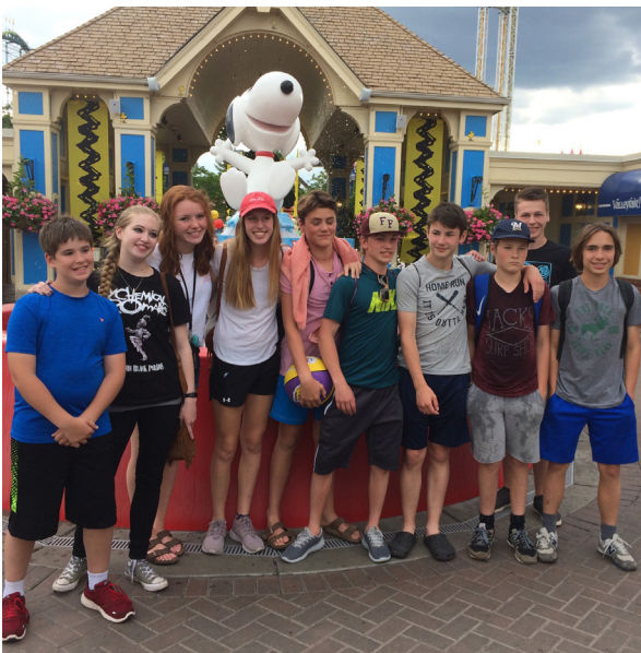
2019 Valleyfair trip