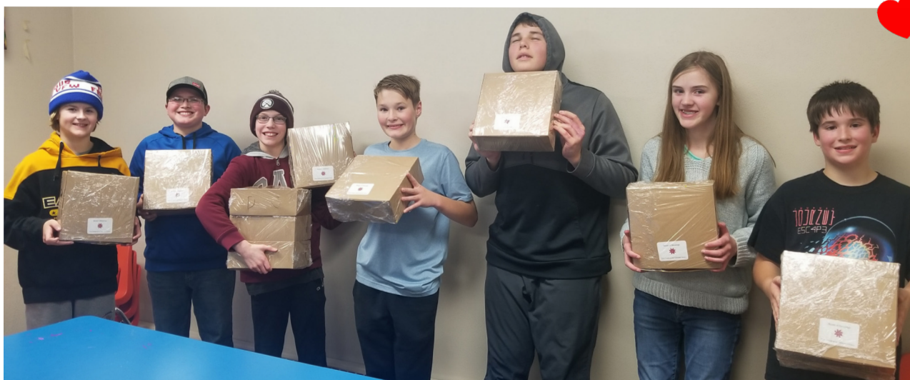
Youth pack 25 Boxes of Blessings for the Fergus Falls Cancer Center.