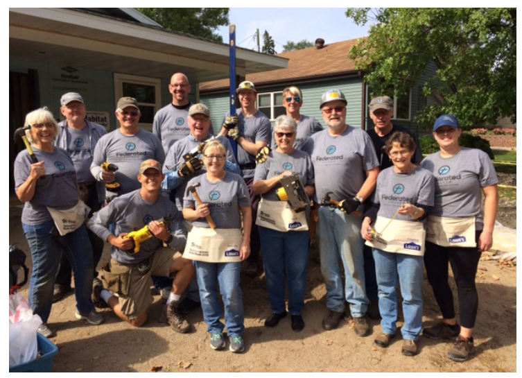
Habitat Build (Federated Crew)