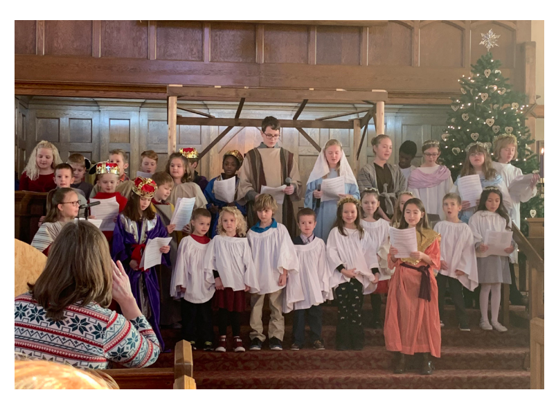
Christmas Pageant 2018

See page 5 for Christian Education Events