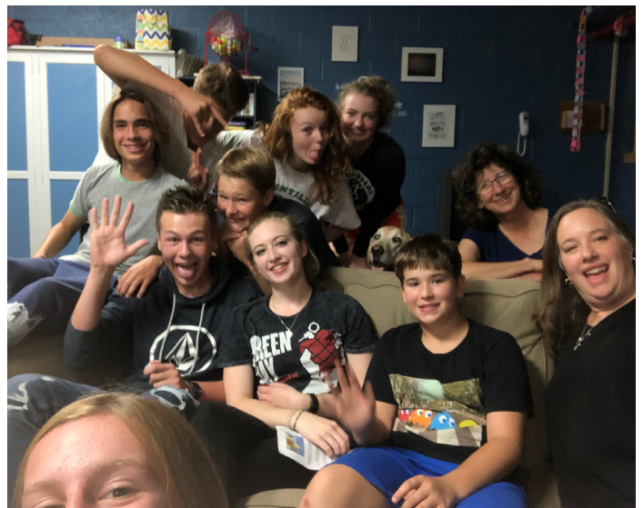
Welcome back to Sr. High Youth Group!