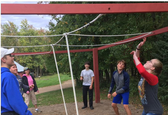
2018 Confirmation Retreat