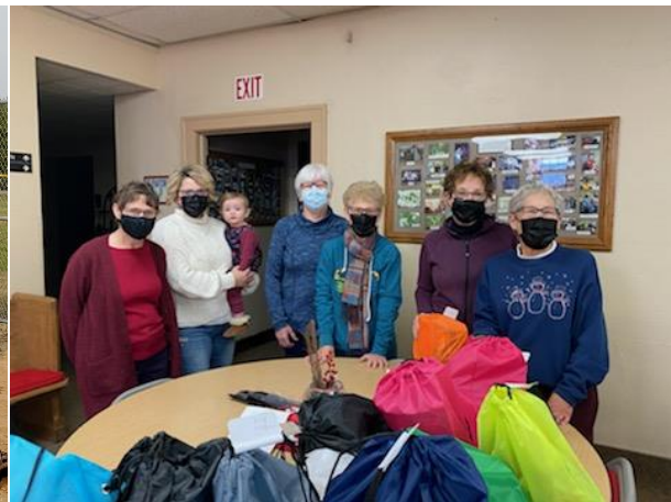
OTC Foster Care gift bags