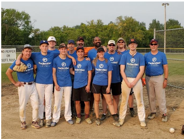
2022 Softball Team