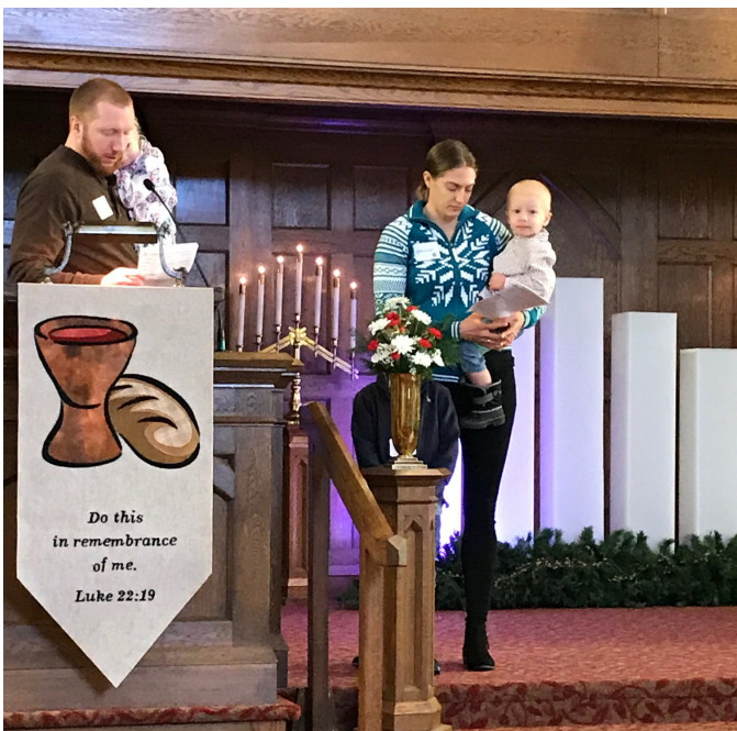
Readers During Advent