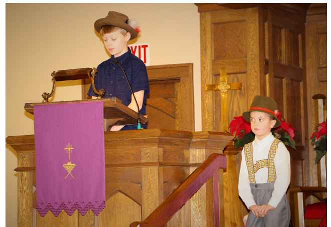
Christmas Pageant 2019 Pictures continue on the bottom of page 5