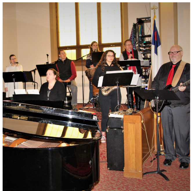
Praise Team at the Christmas Concert